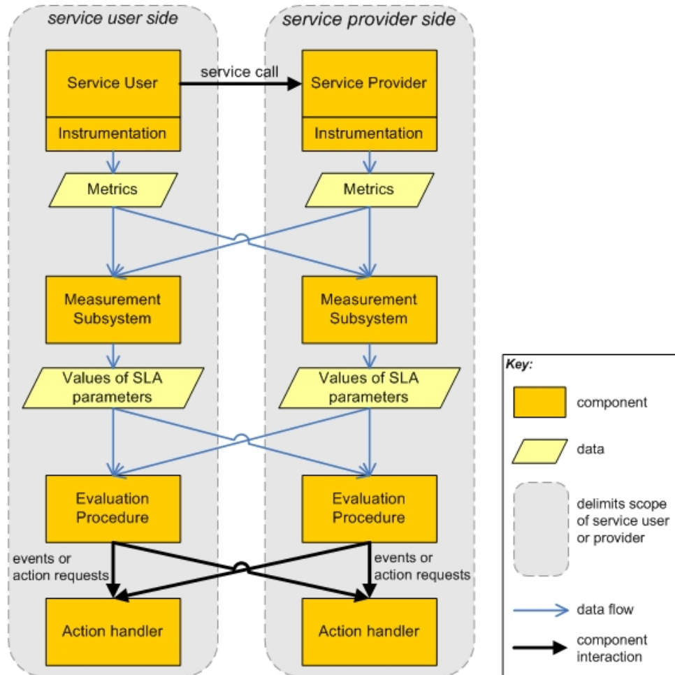
Figure 1: Conceptual Architecture for SLA Monitoring and Management (adapted from the work of Ludwig and colleagues [Ludwig 2003])

The evaluation procedure checks the values against the guaranteed conditions (i.e., the service level objectives) of the SLA. If any value violates a condition in the SLA, predefined actions are invoked. Action-handler components are responsible for processing each action request. While the functionality they execute will vary, it will likely include some form of violation notification or recording. Action handlers may exist on the service user machine, service provider machine, and/or third-party machines.